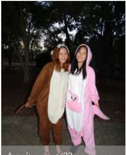
Aren't we cute??