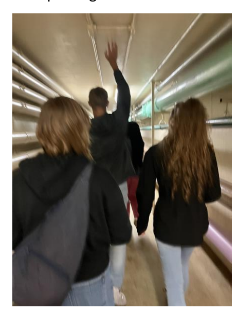
field trip friends walking at the facility