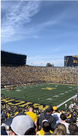
College football game