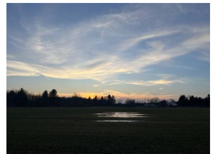
Here are some random pictures of the sky bc I thought they were pretty.