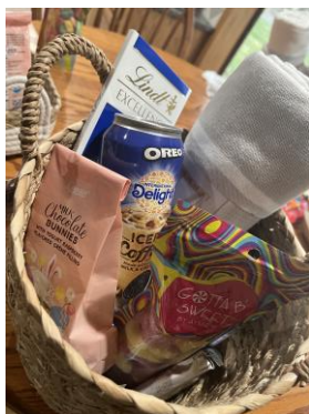
The Easter basket.

Easter is one of the important Christian events. My host family took me to the family gathering. We did egg hunting. For kids there was candy, and for adults there was money in the egg. Hunting was fun, but it was also fun to hide the eggs for adults. We did some other Easter games which was on TikTok, those were fun too. On actual Easter Day, my host mom gave us an Easter basket one for each. I got a towel, bunch of candies and drinks, and stuff like that.